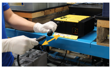
Figure 2: Disconnect AC power.

2. Disconnect the AC power source from the charger, either from the wall outlet, or from the IEC320 connector on the charger.