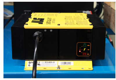
Figure 6: Red fault light blinking

6. After 11 seconds the the red fault light will then blink.